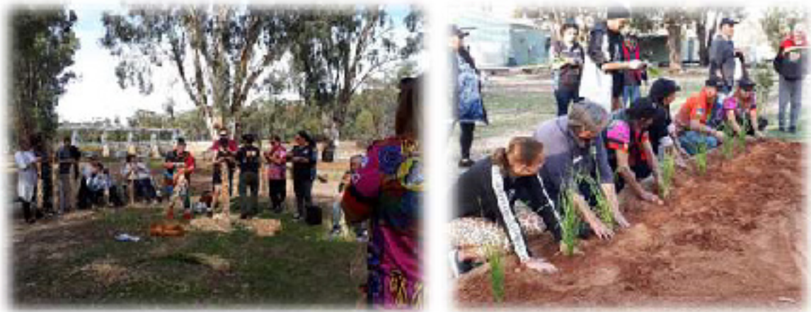
Strengthening Connections to Culture May 2019

The Riverina Murray Regional Alliance is committed to meeting the needs of the Aboriginal community and has done so through these gatherings. Not only have we met the needs of community, but also had the opportunity to hear more about what we could be doing into the future. As in the past, future challenges remain; loss of identity, what it means to be a role model, how to grow and nurture relationships, dealing with racism, strengthening mental health, growing job opportunities; and all of these concerns draw attention to the importance of services continuing to meet the needs of the community.