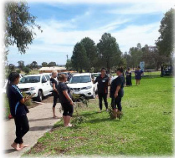
Women connecting and networking at the first Migay Allawah