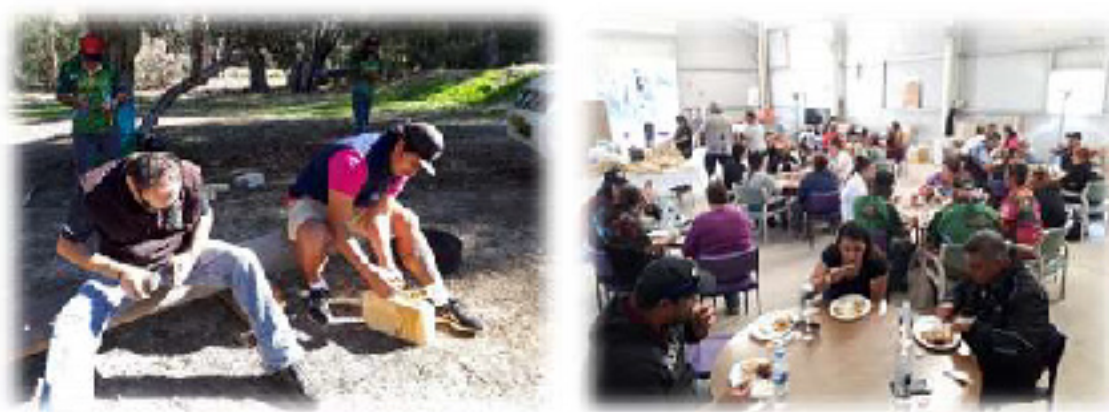
Strengthening Connections to Culture May 2019

We hope that you as the reader, see the benefit to supporting these events and that you may be able to contribute in financial support or in kind in some way.