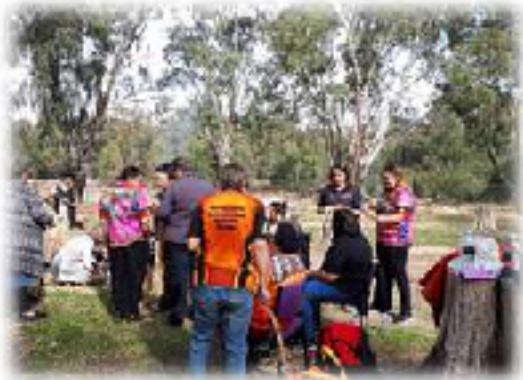
Participants enjoying activities at the first Regional Strengthening Connections to Culture 2019 at Gogelderie Weir