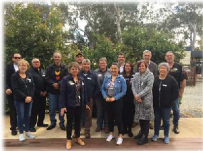
Riverina Murray Regional Alliance October 2019