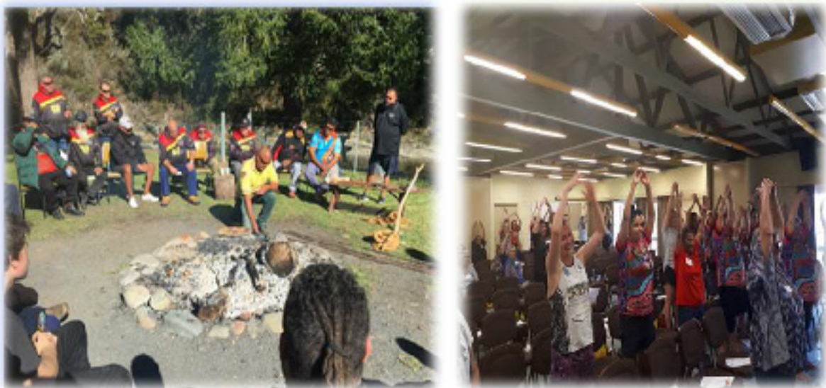
Community members participating in RMRA's men's and women's gatherings

The Riverina Murray Regional Alliance acknowledges Country and Elders past, present and future. The RMRA footprint covers the traditional lands of the Wiradjuri, Wamba Wamba/ Wemba Wemba, Perrepa Perrepa, Yorta Yorta, and Muthi Muthi nations.