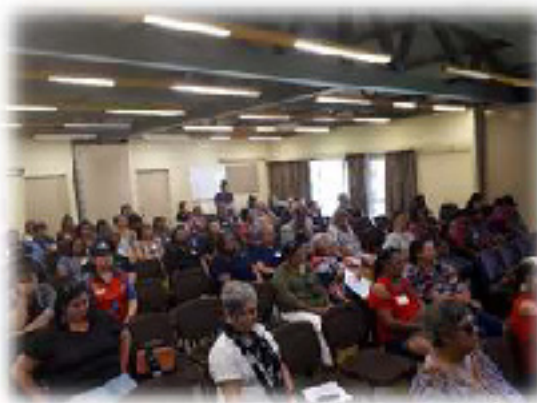
Migay Allawah Yanco 2018